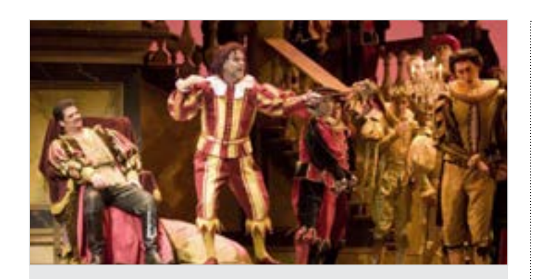
MUSIC OF ITALY: LA PATRIA DELLA MUSICA