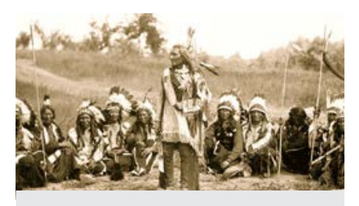
HOW THE INDIANS LOST THEIR LAND