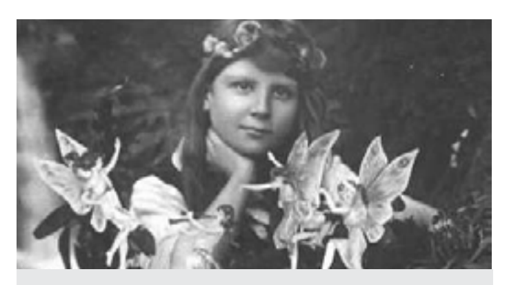
PHOTOGRAPHIC FAKES, FANTASIES, AND FABRICATIONS