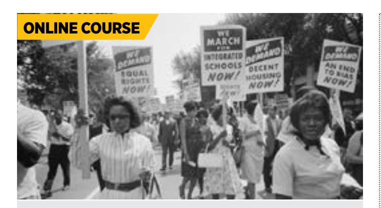
AFFIRMATIVE ACTION: PAST, PRESENT, AND FUTURE