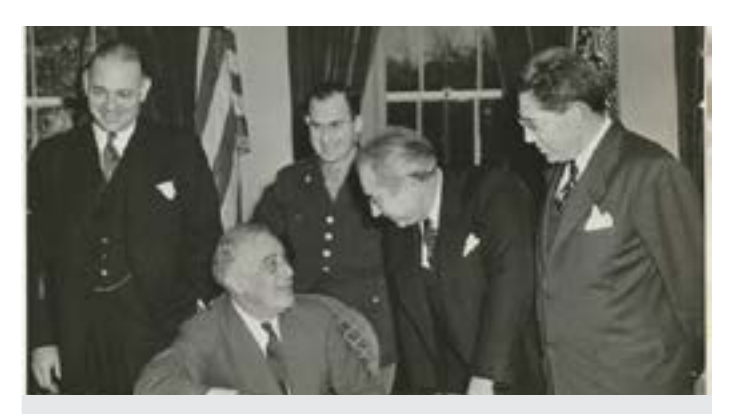
THE HISTORY OF ANTISEMITISM, A DOCUMENTARY APPROACH