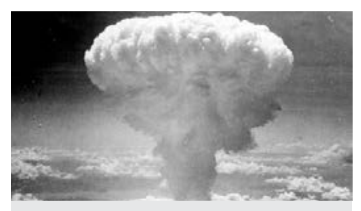
THE ATOMIC BOMB AND THE END OF THE WAR IN THE PACIFIC