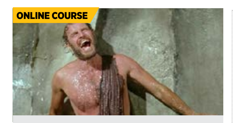
THE FILMS OF CHARLTON HESTON