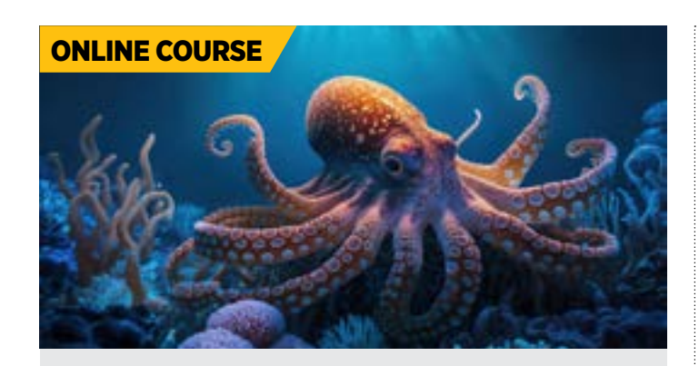
LIFE IN THE ABYSS