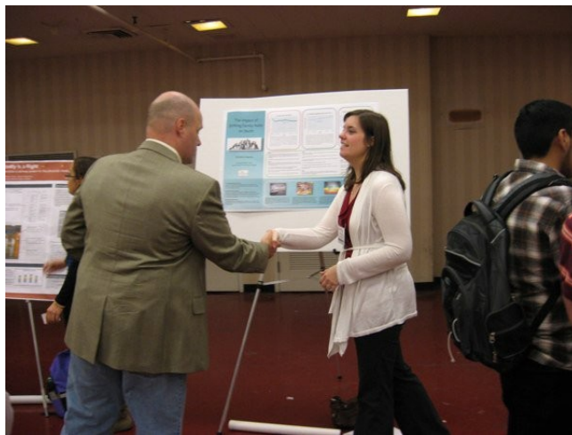
Presentations of student research at the 2010 NCHC Conference.

Honors Capstone Projects are specially designed projects within some majors that allow students to complete their Honors Electives requirements while also fulfilling major requirements. Honors Capstone Projects are currently available for Dance, Music, Music Education, Occupational Therapy, and the Clinical Track in Psychology. (Honors Capstone Project options may be added throughout the year.) For more information about Honors Capstone Projects, please contact the Assistant Dean.