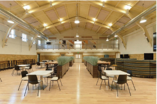
STARTUP AT THE ARMORY, OPENED FALL 2021