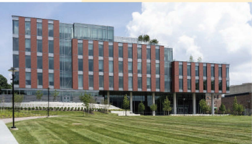
COLLEGE OF HEALTH PROFESSIONS, OPENED SUMMER 2024