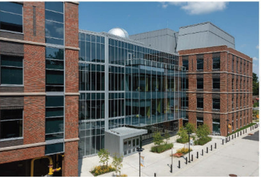
SCIENCE COMPLEX, OPENED FALL 2021