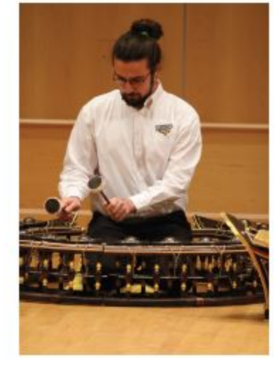
Special thanks to the Maryland State Arts Council, Citizens of Baltimore County, and AA&CC members for making this initiative possible!