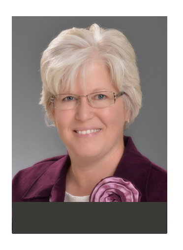
"Exceptional faculty are responsive to students' needs as they build high caliber learning experiences."

3 Message from the Dean 4 By the Numbers 6 New Building News 8 Our Focus On Collaboration 10 New Faculty: Expertise and Research Interests 12 Dean's Distinguished Alumni Award 13 Faculty Publications: 2018-2019 18 Spotlight on Astou Gaye 19 Hussman Center at the IWB