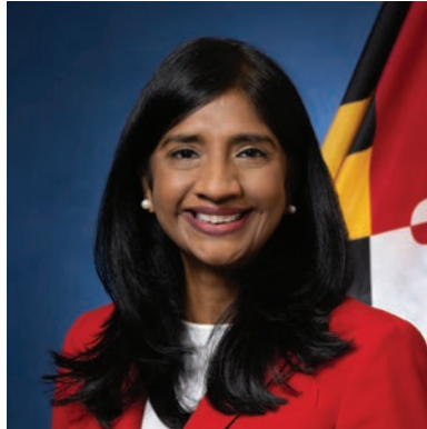
Aruna K. Miller Lieutenant Governor, Maryland

Mayor Scott has emerged as a political leader known for his authentic, straightforward approach. He serves as Co-Chair of Mayors Against Illegal Guns and as President of the African American Mayors Association.