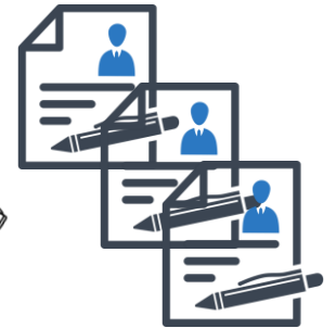
4. Applicant Recommendations