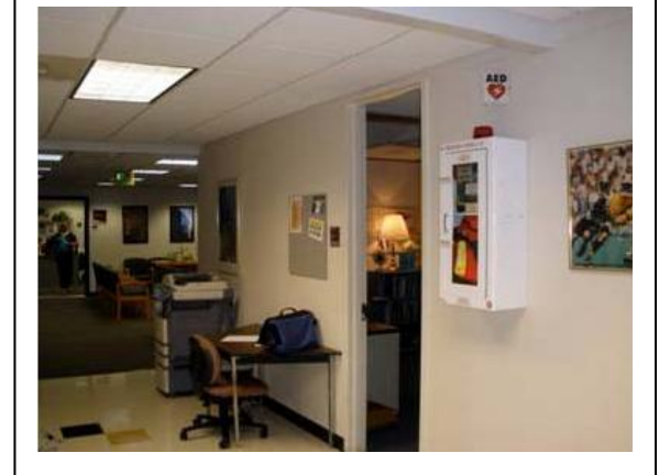
Towson University – Enrollment Services Hallway, outside room 213